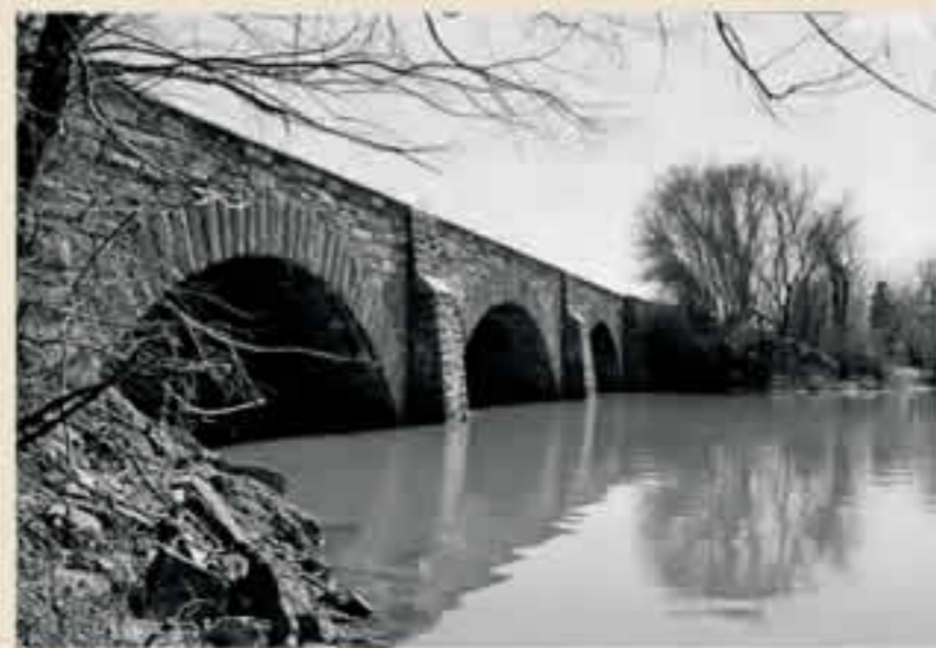
Bridge over Hunting Creek

The road proposal lagged for many years until a plan was developed in the 1920s to build a highway from Arlington's Memorial Bridge to Mount Vernon, to be called Mount Vernon Boulevard. After consideration of two routes, one along an inland ridge of high ground, the other along the edge of the Potomac, the latter route was selected, using the old trolley right-of-way. The proposal was revised to commemorate the 200th birthday of the nation's first president in 1932, and renamed the George Washington Memorial Parkway. Within the City of Alexandria, the parkway travels the same path as historic Washington Street, laid out in 1749. Nearly 200 years later, in 1946, the City Council established the "Old and Historic Alexandria District", America's third municipal historic district, in part to protect the commemorative nature of the parkway.