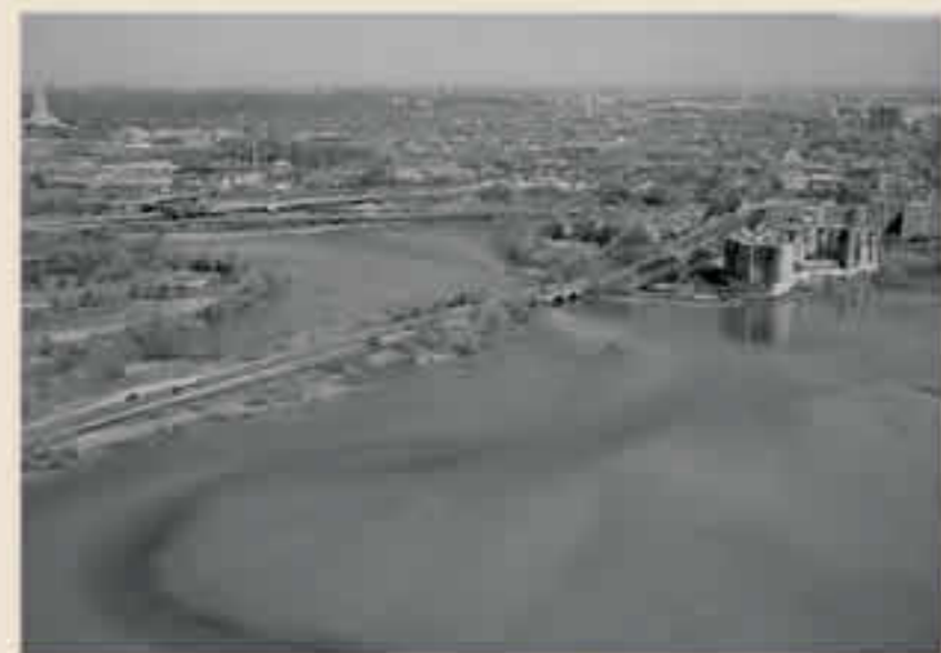
G.W. Memorial Parkway aerial view

A visit to George Washington's Mount Vernon estate, about nine miles to the south, has long been viewed as a patriotic duty of Americans. In the late 19th century, visitors often traveled there from Washington by boat, stopping first in Alexandria. By 1887, Alexandria business leaders established a "Mount Vernon Avenue Association" to lobby for construction of a federal roadway to reach the estate. As conceived, the park-like boulevard would travel south from Alexandria, passing through a rural area of woodlands and scenic vistas. This route would periodically incorporate a series of landscaped pavilions and monuments, where visitors would learn the history, industry and people associated with each of the 13 original states. But in the years just before the 20th century, a trolley line was built, passing through downtown Alexandria and providing inexpensive travel to Mount Vernon, thwarting the roadway plan.