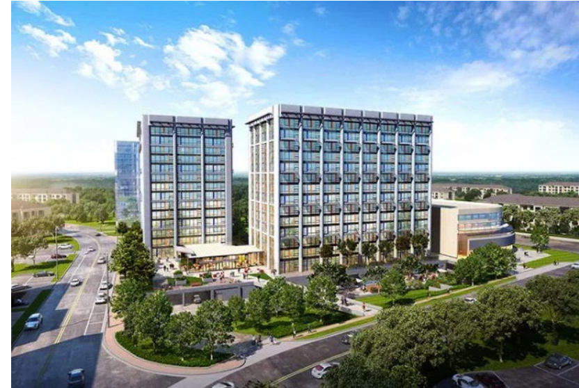
A rendering of the office-to-apartment conversion project at the Park Center complex in Alexandria.