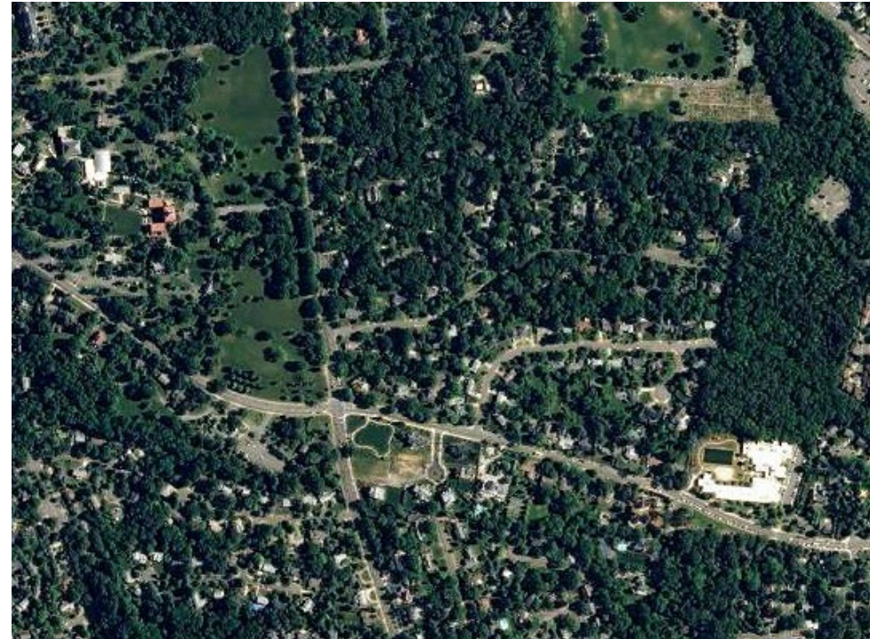
A neighborhood in Alexandria composed of single-family detached homes