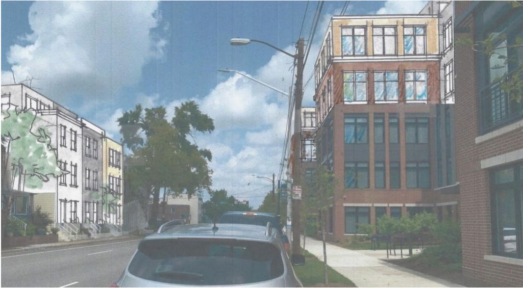
Visual depiction of “bonus height.”

This initiative would incentivize more use of Section 7-703 of the zoning ordinance that allows additional height in new residential projects in exchange for affordable housing. Current law allows the provision to be used in areas with a height limit greater than 50 feet, and the proposal is to allow it to be used in areas with height limits of 45 feet or more. A goal of the initiative is to expand housing choices and dispersion throughout more areas of the City in a manner that is harmonious to the surrounding physical context of the community.