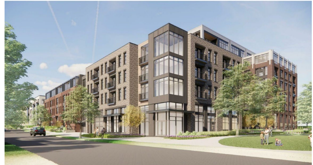
The Heritage at Old Town, the first project to use the RMF Zone