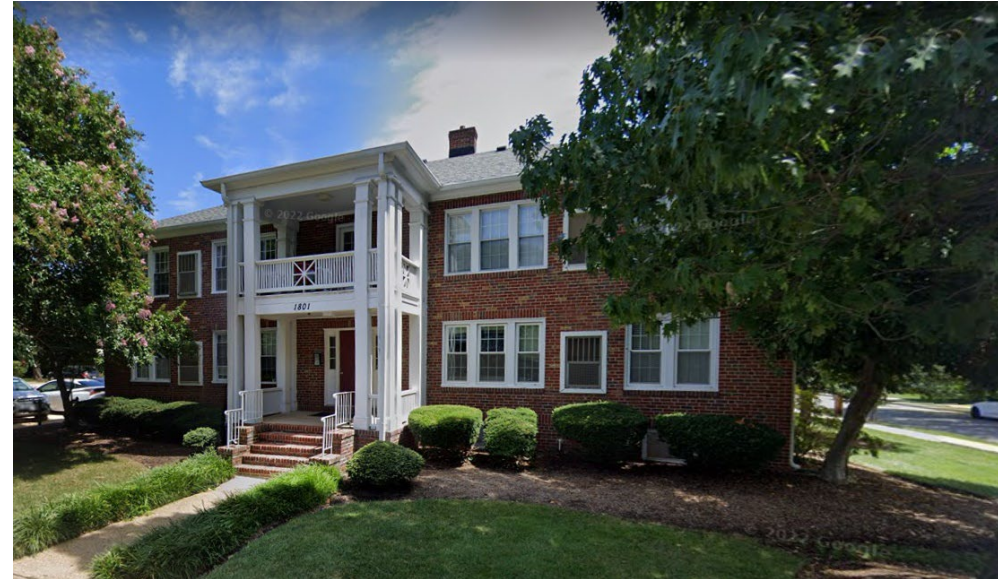
Alexandria Square condominiums, Del Ray

The purpose of this initiative is to identify land use patterns, such as the mix of uses and building types found in historic neighborhoods (Del Ray, Rosemont, Old Town, and Parker-Gray) that can no longer be built under existing zoning. Characteristics of historic land use patterns that are desirable would be identified along with recommendations for changes to the Zoning Ordinance to allow these patterns to be considered.