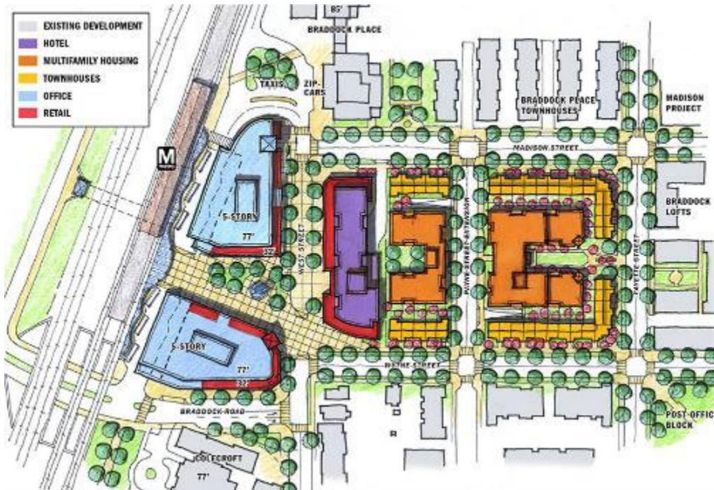
Illustration from the Braddock Metro Neighborhood Plan

This initiative will review existing permitted densities within the walksheds of existing and planned Metro stations and BRT stations. It would further analyze any existing barriers currently in place that limit increased densities around transit stations.