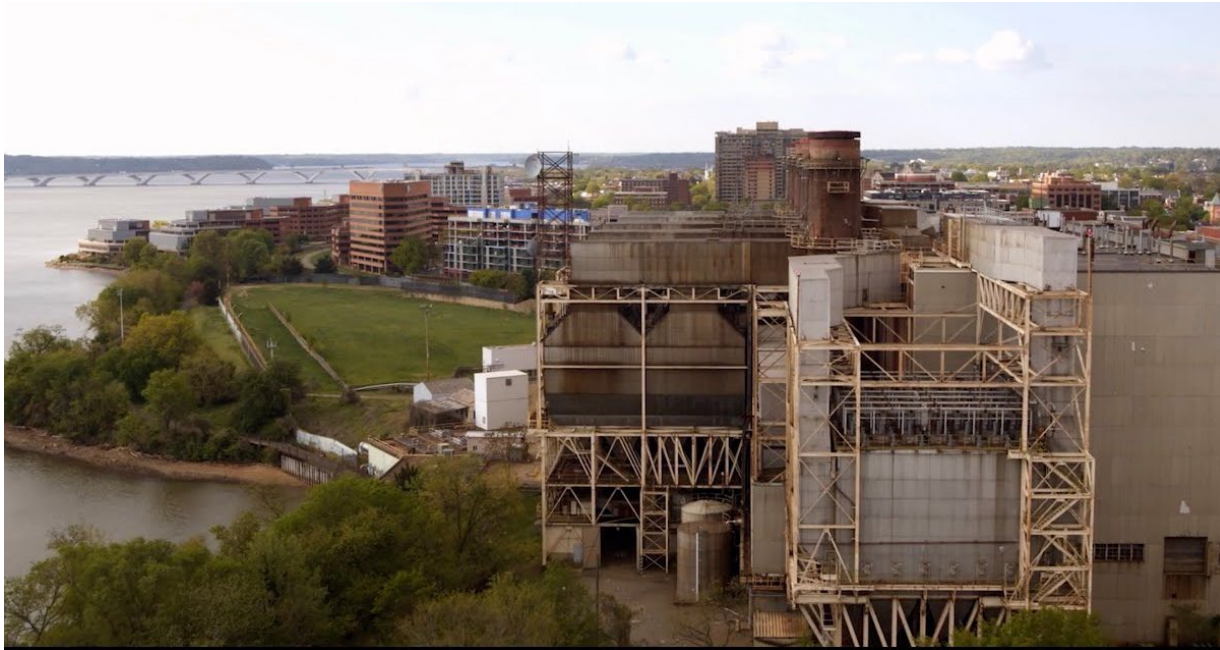
Potomac River Generating Station, Old Town North

Coordinated Development Districts(CDDs) establish the zoning for large tracts of land planned for redevelopment. The purpose of this initiative is to ensure that the creation of affordable housing is supported in each new CDD. The recent CDD for the Potomac River Generating Station site is a model that staff will examine for potential application in future CDDs.