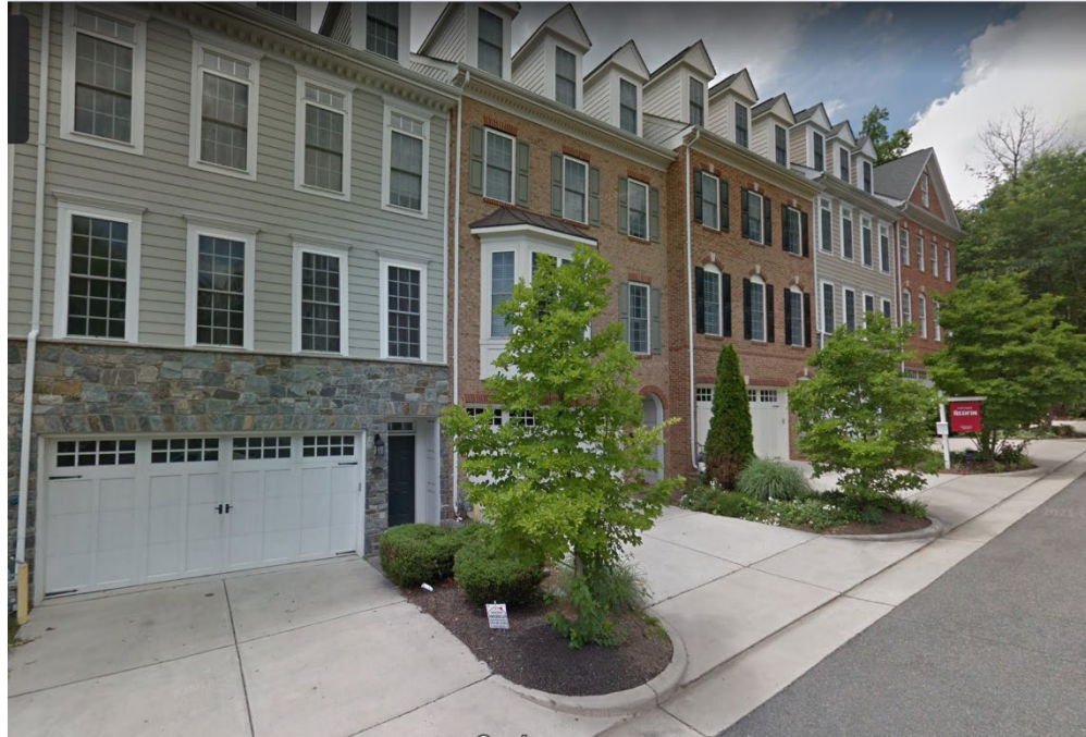
Townhouses on Goddard Way in Alexandria

Townhouses have been a popular housing type throughout Alexandria's history. Alexandria's zoning ordinance allows townhouses in multiple zones, but the rules can be very different depending on the zone. This initiative will seek to create a common set of rules for townhouse development and reduce unnecessary regulatory barriers to townhouse construction within commercial zones.