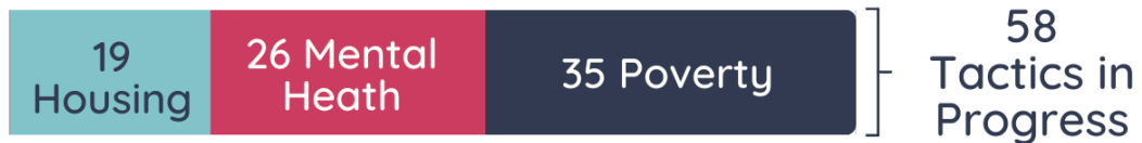
Tactic Progress by Priority