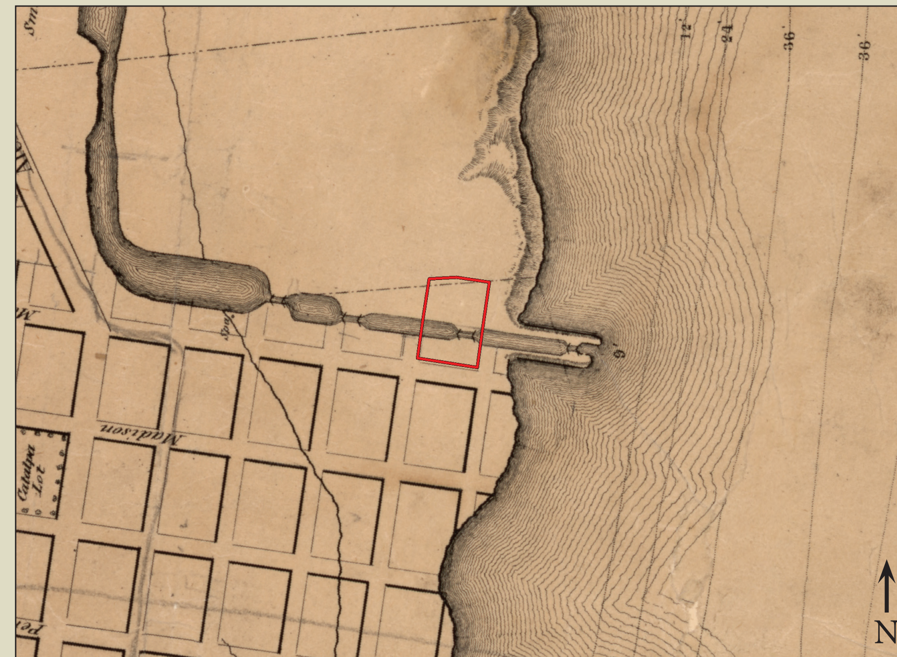
"Plan of the town of Alexandria, D.C. with the environs: exhibiting the outlet of the Alexandria Canal, the shipping channel, wharves, Hunting Cr. &c." Red outline shows the block you are standing on. (Maskell C. Ewing, T. Sinclair, and Edw. B. Stelle 1845).

Completed in 1845, the three locks and four pools were constructed of wood and lined with large slabs of stone. Iron gates controlled the flow of water between them, which reached a depth of 15.5 feet and allowed the boats to drop from 38 feet above sea level at the turning basin down to the mouth of the canal at the Potomac River.