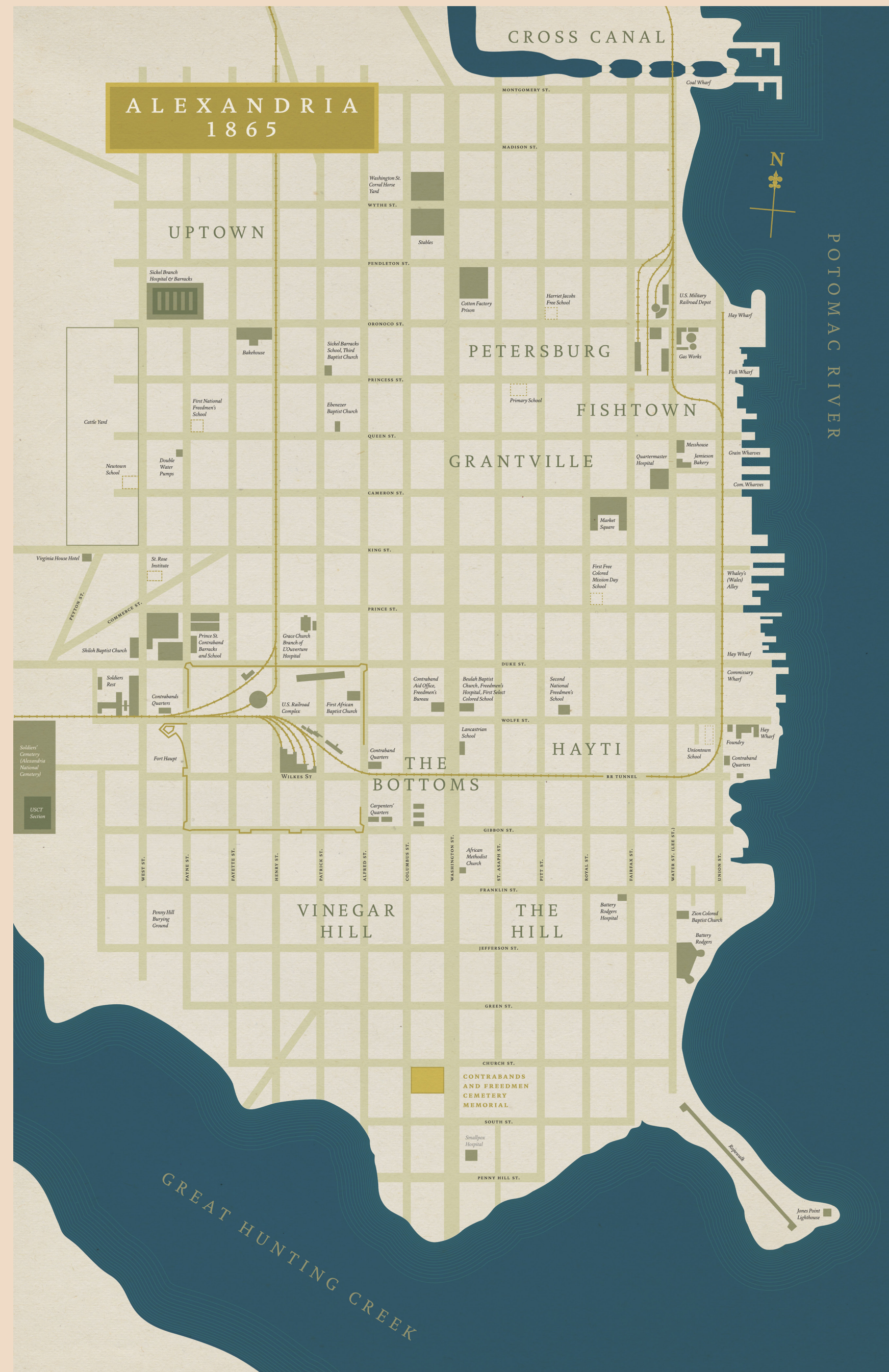
Alexandria in 1865.