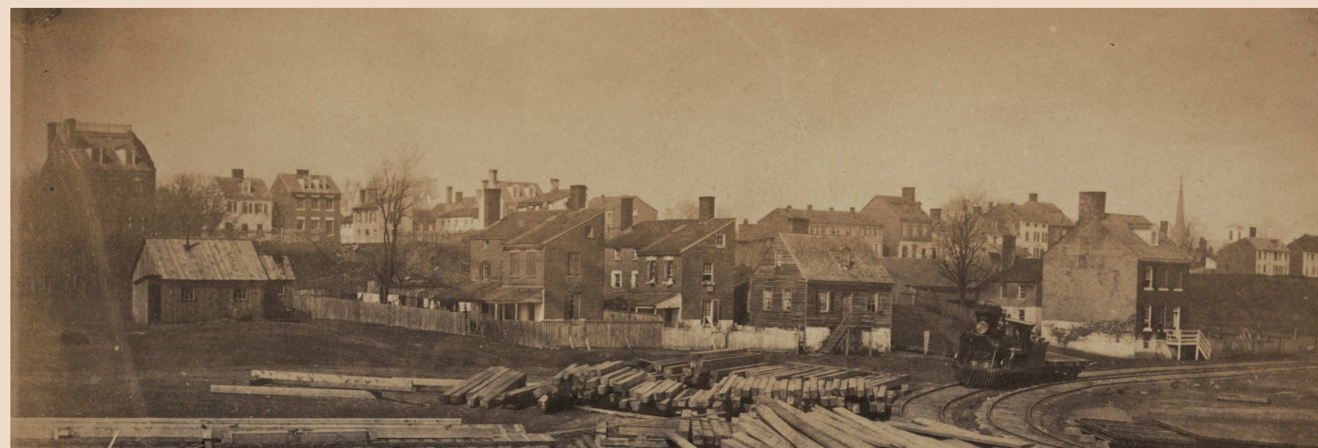
Andrew J. Russell’s “Track near the Potomac River, in Alexandria,” ca. 1863-5. Taken near the foot of Franklin Street and looking northwest back toward the Wilkes Street Tunnel, this Civil War-era photograph of a military construction yard also captures part of what would become the Zion Bottom neighborhood. The entrance to the Wilkes Street Tunnel is behind the house to the right of the train engine.

Community names in greater Alexandria reflected the areas that enslaved people fled from during the Civil War (Petersburg), characteristics of their new settlements (Newtown), or recognition of those who supported the cause of freedom (Grantville). These names, however, and the boundaries of the neighborhoods were also in flux and reflected the flows of African American refugees in and out of the city along with Alexandria’s racial politics.