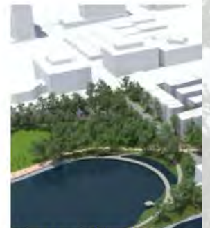
Diagram - Rivergate Park and OLIN Design