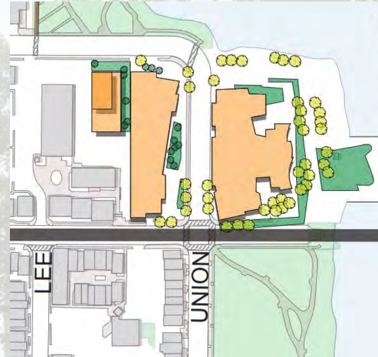
OTNSAP Illustrative Layout (Page 45)

URBAN DESIGN ADVISORY COMMITTEE February 7, 2024