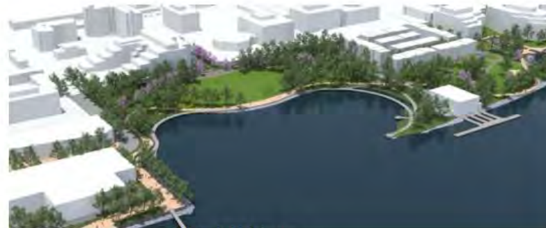
Diagram - Oronoco Bay Park, OLIN Design

The Waterfront plan area extends from Wolfe Street in the south to Tidlock Park in the north, between the River to the east and Union and Fairfax Streets to the west. It incorporates a number of existing waterfront parks in the Old Town North plan area, including Oronoco Bay Park, Wythe Street Plaza, Rivergate Park, and Tidlock Park. There are opportunities for open space expansion and enhancements along the Waterfront north of Tide Lock Park to the northern end of the Old Town North plan boundary.