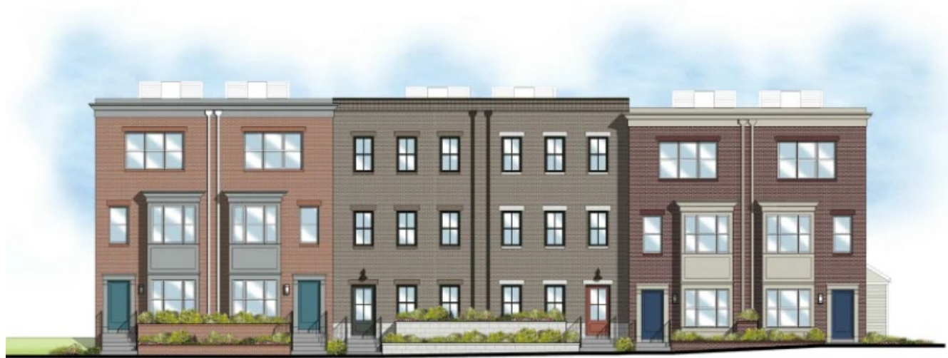
Rendering of the Seminary Road Townhouses