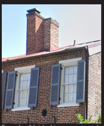
Example of brick chimneys commonly found on historic Old Town residences.