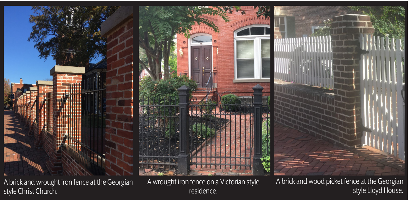
A brick and wrought iron fence at the Georgian style Christ Church.