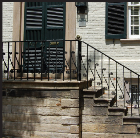
Example of historically appropriate stone steps, iron handrail and guardrail on a Georgian style residence.