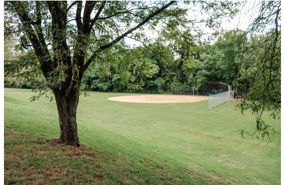
Angel Park Field