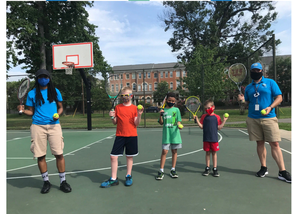
Armistead Boothe Park